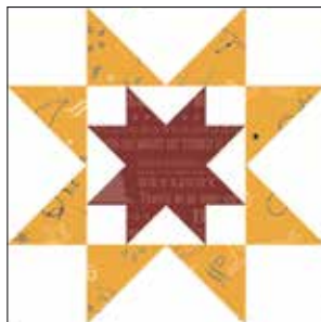
Corner Star Block

Sew a Unit F to the top and bottom of Unit E to create the Corner Star Block. Repeat to make a 4 Corner Star Blocks.