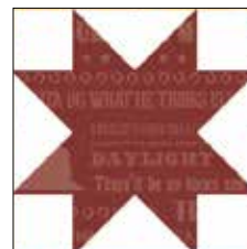
Corner Star Center

Sew a Unit D to the top and bottom of Unit C to create the Corner Star Center. Repeat to make a total of 4 Corner Star Centers.