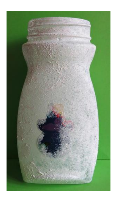
Find great craft projects at www.FaveCrafts.com.

1. Use the paintbrush to dab a thin, uneven layer of white paint all over the jar. Apply paint all the way up to the top lip of the bottle, but do not paint the base of the jar. Allow to dry thoroughly.