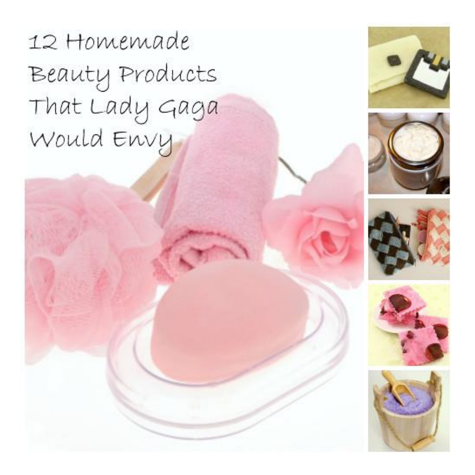
Pamper yourself this winter when you check out our collection of <u>Homemade Beauty Products That Lady Gaga Would Envy!</u>

In a lidded container – to each cup of rock salt, add 3-5 drops of vegetable food coloring, mixing with spoon or shaking well after each couple of drops until desired color is reached. To colored crystals add 20-25 drops essential oils. Lavender, rose, or geranium essential oils provide a lovely scent. Mix well or shake container until oils are thoroughly absorbed. To make them glisten like little jewels, add 1 teaspoon glycerin. Package the crystals in your pretty jar. To use, add ½ cup to your warm bath.