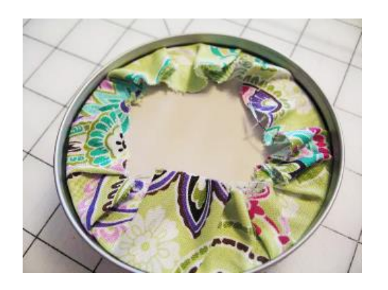
Instructions continued on following page