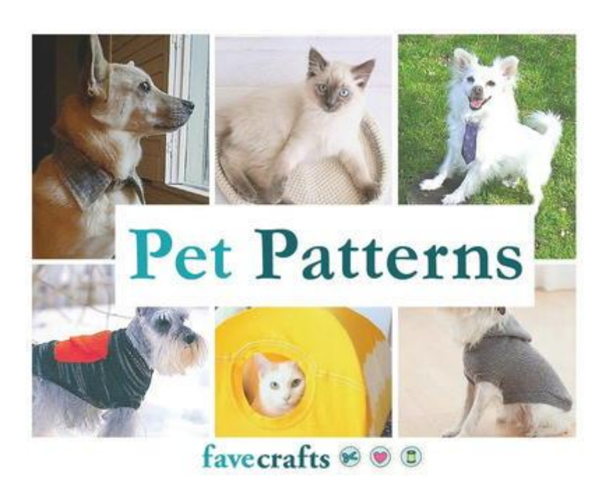
Got pets? Then you'll love exploring our collection of <u>Patterns for Pet Clothing and More Pet Crafts</u>!