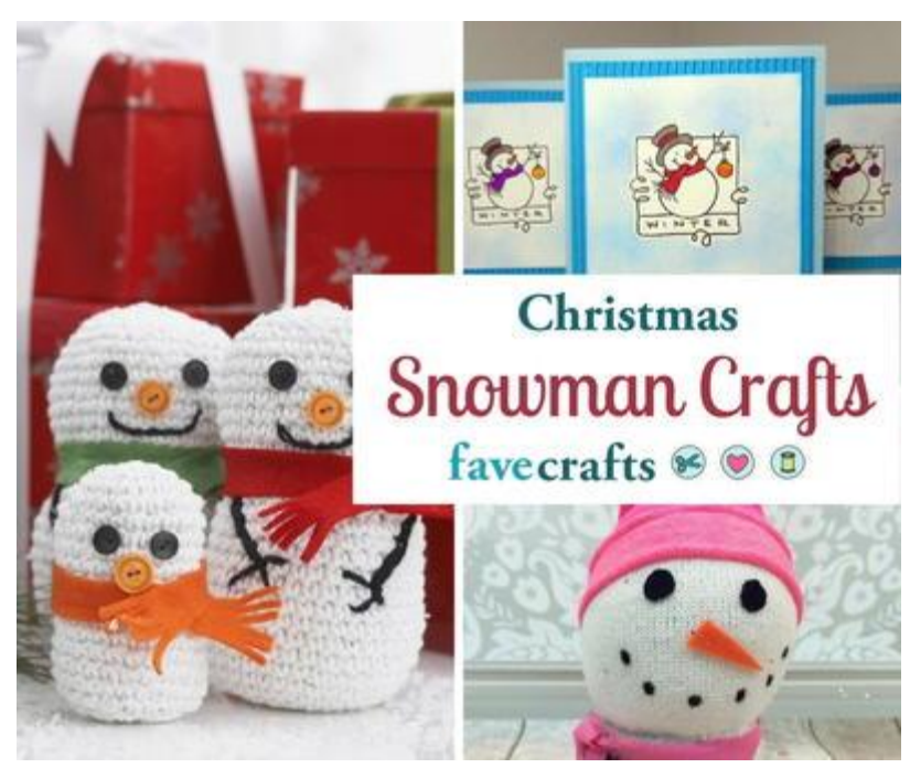
You don't have to go outside to build a snowman this winter! Stay warm and take a look at our collection of <u>Snowman Christmas Crafts</u>.