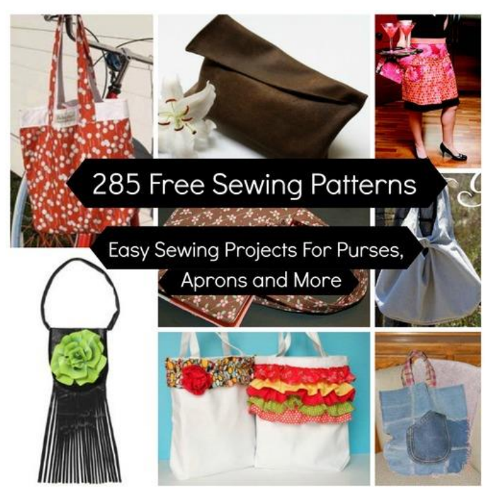
Do you love to sew? Then our collection of <u>Free Sewing Patterns</u> needs to be on your radar!

Monogram the top and use it as a "treasure jar." Add ribbon, paint, and other embellishments to the band to give it even more personality.