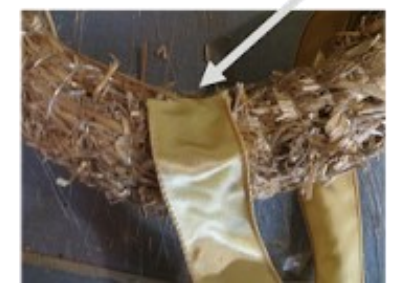
Instructions continued on next page