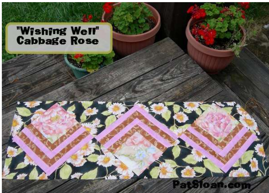
“Cabbage Rose Version”