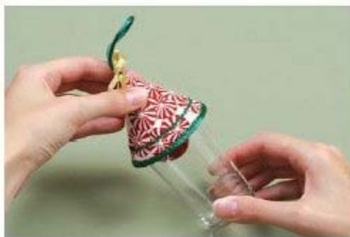
Cool to shape over a small glass after steaming.

Note: Make the circle a bit bigger and cut it in thirds for a longer, leaner bell. OR Sew some prebeaded fringe inside the bell so just the beads show from the outside. Attach with decorative or monofilament thread, depending on what you want for the outside of the bell.