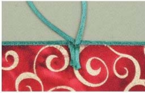
Leave cording at the start and a loop at the end.