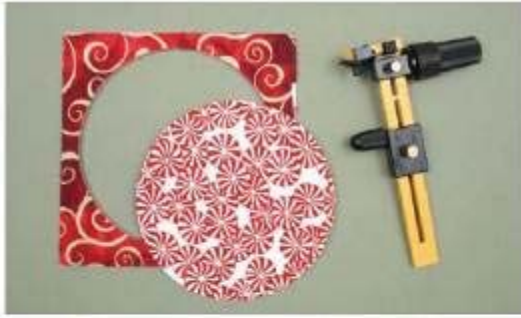
A circle cutter makes the job faster and easier.