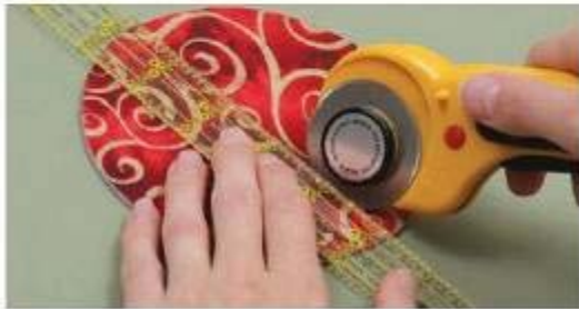
Cut the circle in half.