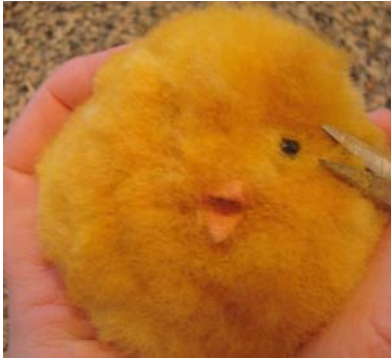
14. "Cheep Cheep!"