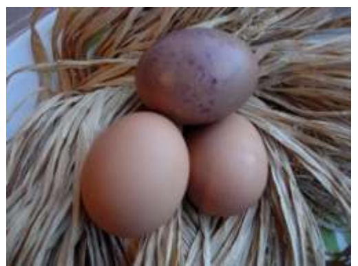
Above: blueberry dye on brown egg and two natural brown eggs

To find out if an egg is raw or hard boiled, spin it on its side. A raw egg will wobble unsteadily and a hardboiled egg will spin easily.