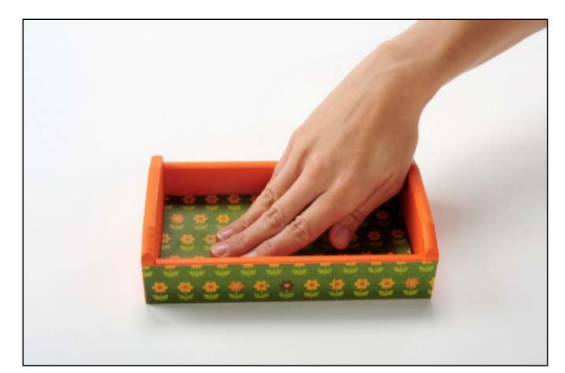
Keep smoothing until all of the bubbles are removed.