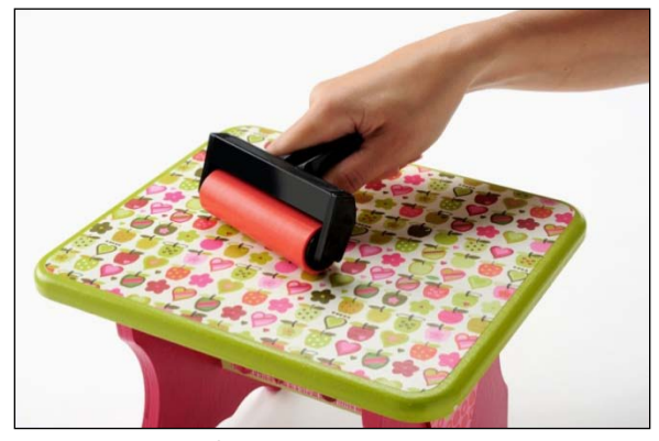
Use the brayer for larger items such as furniture.

Wipe away excess Mod Podge with your brush.