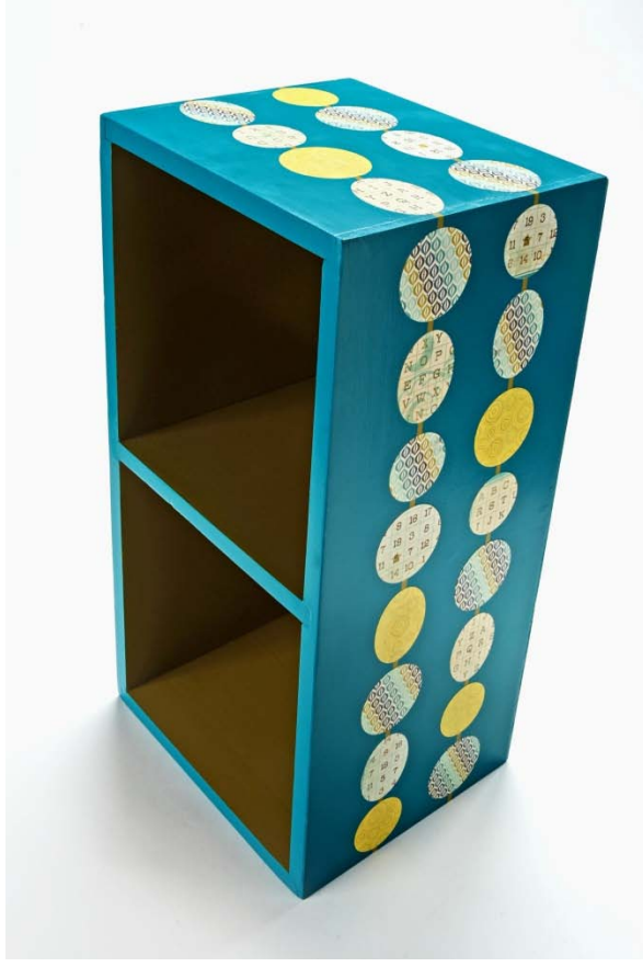
If you like simple pieces with simple geometric shapes and are always looking for more storage space, this bookcase will be a stylish and functional fit.