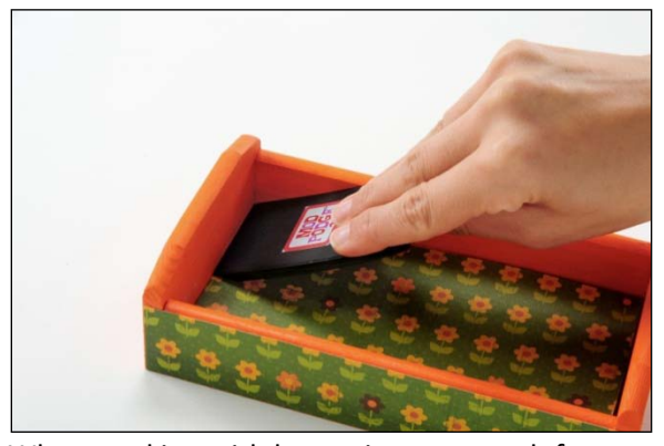
When working with large pieces, smooth from the center outward. Air bubbles can be removed with the Mod Podge Tool Set. Use the squeegee with smaller items such as trays – it was developed specifically for getting into corners.