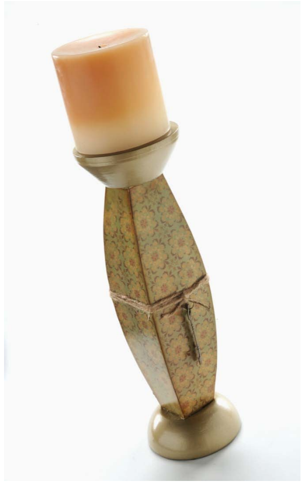
Take a flat-surfaced candle holder and transform it by decoupaging paper and adding a few accents. This is a great trash-to-treasure project for flea-market finds or your own decorative items that no longer suit your style.