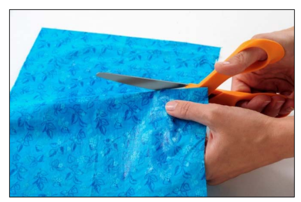
Allow to dry. This will allow you to cut the fabric like paper without frayed edges.

Fabric – Wash and dry the fabric (do not use fabric softener). Iron and then lay out on a covered work surface. Wax paper is preferable for covering your table. Using a brush, paint a light coat of Fabric Mod Podge onto your fabric.