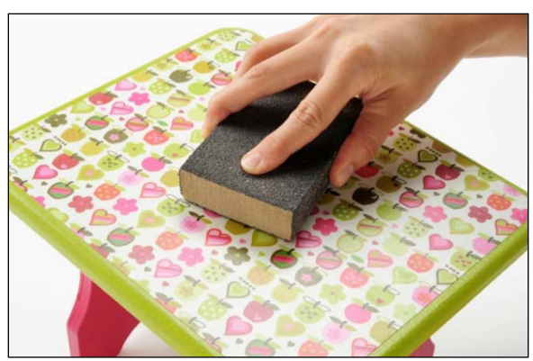
For a very smooth finish, wet a piece of #400 grit sandpaper with water and sand lightly between coats. Wipe dry and polish with #0000 steel wool on the final coat.

Add a protective coat of Mod Podge to your project using a sponge or flat brush. Allow to dry and then repeat. The number of coats you finish with is up to you, but we recommend at least two.