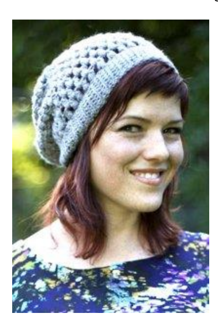
Sizes: Women's S/M (L/XL)

A free crochet hat pattern like this Grey Slouchie Beanie is just what every woman needs for the winter. Caron International 'Simply Soft' is used in a Grey Heather color, but you can use any color you wish. The puff stitch is used to create a fun design.