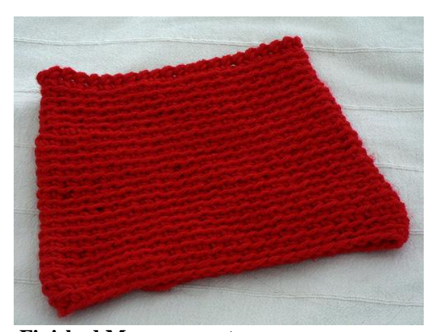
Finished Measurements: 22" (56cm) circumference around the widest

You will need to have basic crochet skills. This project uses a slightly advanced stitch, simple shaping and edging.